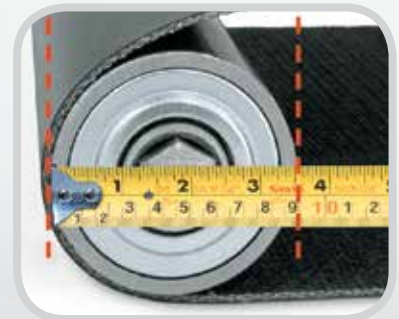
Measure smallest pulley diameter.