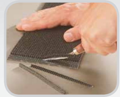
Skive impression cover.